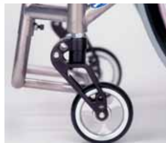
Frog Legs® suspension forks.